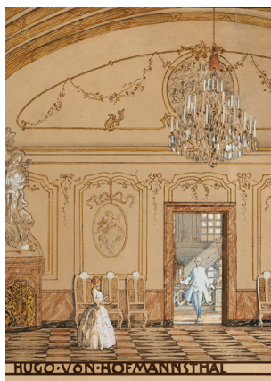
Exhibition subject based on Alfred Roller Stage design for Der Rosenkavalier (Libretto: Hugo von Hofmannsthal, Music: Richard Strauss), 2nd act, 1910

The exhibition is taking place in collaboration with Freies Deutsches Hochstift, Frankfurt am Main, one of Germany's oldest cultural institutes, which keeps the majority of Hugo von Hofmannsthal's estate. Freies Deutsches Hochstift is the governing body of the Deutsches Romantik-Museum, which will show the exhibition Hofmannsthal. Szenen. Literatur, Identität und Zeitgeschichte 1874–1929 [Hofmannsthal. Scenes. Literature, Identity and Contemporary History 1874–1929] from 3 October 2024 to 5 January 2025.