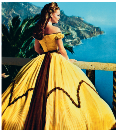
Sissi: The Fateful Years Of An Empress (AT 1957) Director: Ernst Marischka, 19 December 1957

www.theatermuseum.at/showbizmadeinvienna