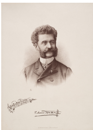
Johann Strauss with facsimile signature of his name and music Anonymous, undated Printed by: Jos. Eberle & Co., Vienna

The composer wrote more than 500 works of dance and concert music as well as sixteen works for the stage. We continue to encounter these works in concert halls and beyond: at the Vienna New Years Concert in the Golden Hall of Musikverein, in films and in advertising, and when it welcomes passengers upon landing in Vienna. Johann Strauss is still a man of the moment.