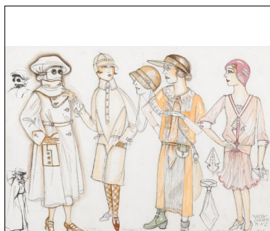
Costume design Monika von Zallinger Cat Tongues (Miguel Mihura) Theater in der Josefstadt, Vienna, 2001 Theatermuseum © KHM-Museumsverband

Photos are free of charge in relation to the press coverage of the exhibition. They are available for download under www.theatermuseum.at/presse/