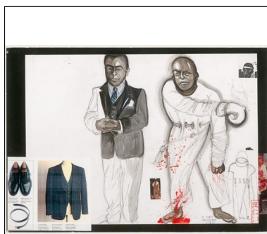
Costume design Monika von Zallinger The Shadow Line (Tankred Dorst) Akademietheater, Vienna, 1986