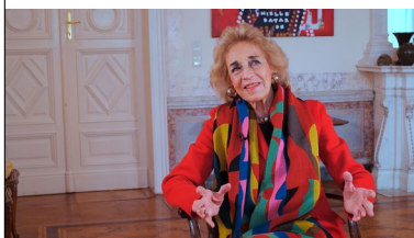
Monika von Zallinger Theatermuseum © KHM-Museumsverband