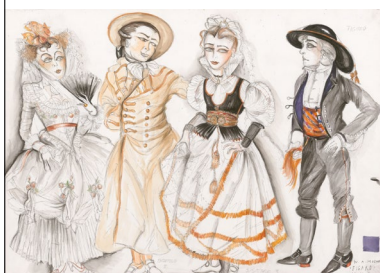
Costume design Monika von Zallinger The Marriage of Figaro (Wolfgang Amadeus Mozart) Semperoper, Dresden, 1995 Theatermuseum © KHM-Museumsverband