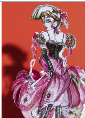
Exhibition poster Theatermuseum © KHM-Museumsverband

Photos are free of charge in relation to the press coverage of the exhibition. They are available for download under www.theatermuseum.at/presse/